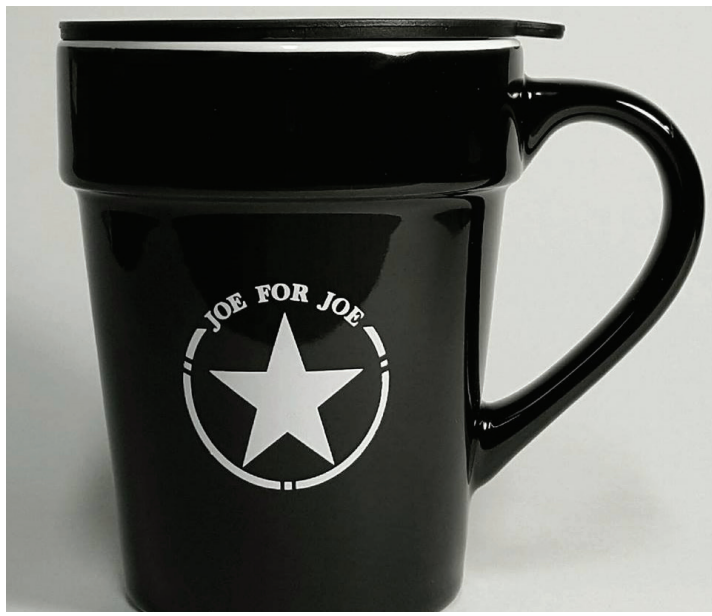
Joe for Joe mug