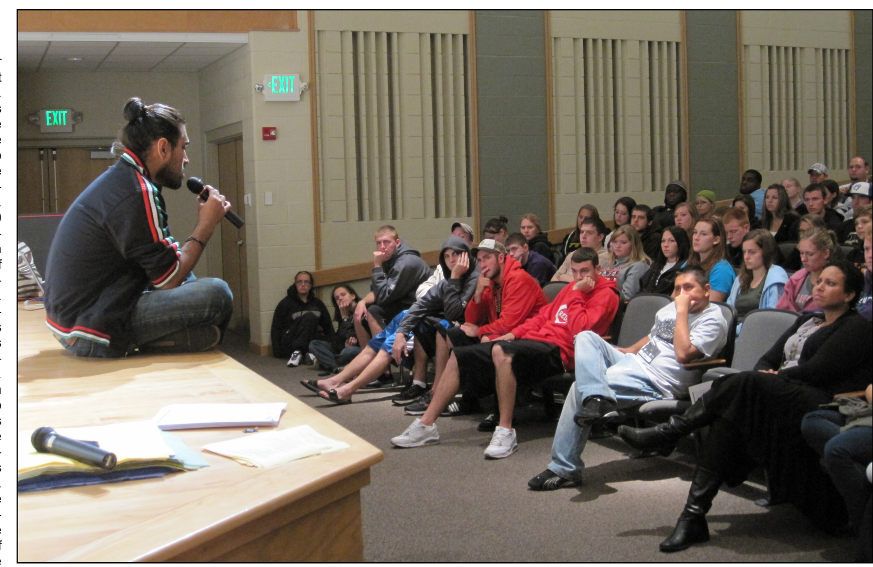
DREAMING TO ACT Students watch and listen intently to the presenter from the Latino Youth Collective (LYC) as he spoke about the possibility for immigrants to the country to attend college.

The documentary took a look at the lives of many of the alien minors in Indiana who are unable to attend college or find jobs because they don't have social security numbers or aren't citizens of the United States. Many of the students interviewed for the documentary spoke in Spanish and said that they were proud that they were undocumented. The