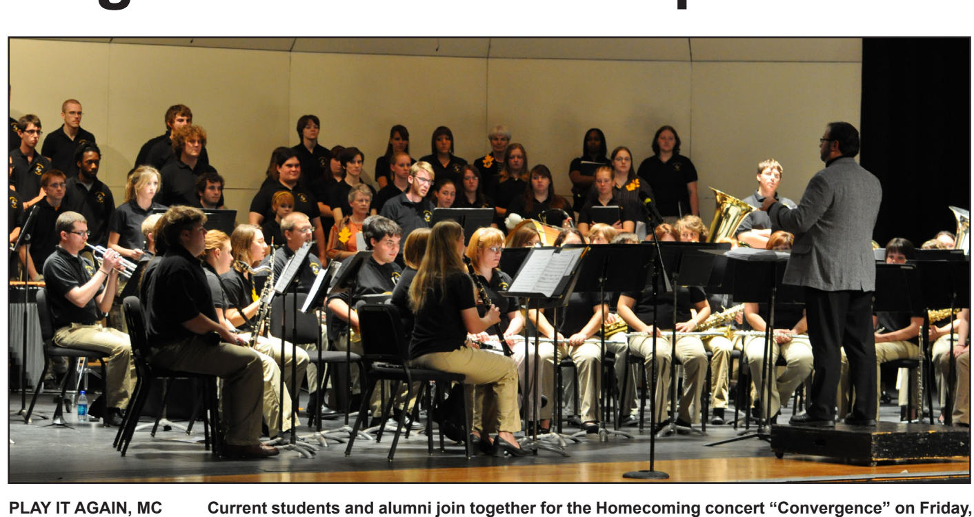
October 22. The women's choir Cantabile, the Jazz Ensemble, the A Cappella Choir, and Symphonic Band were highlighted.