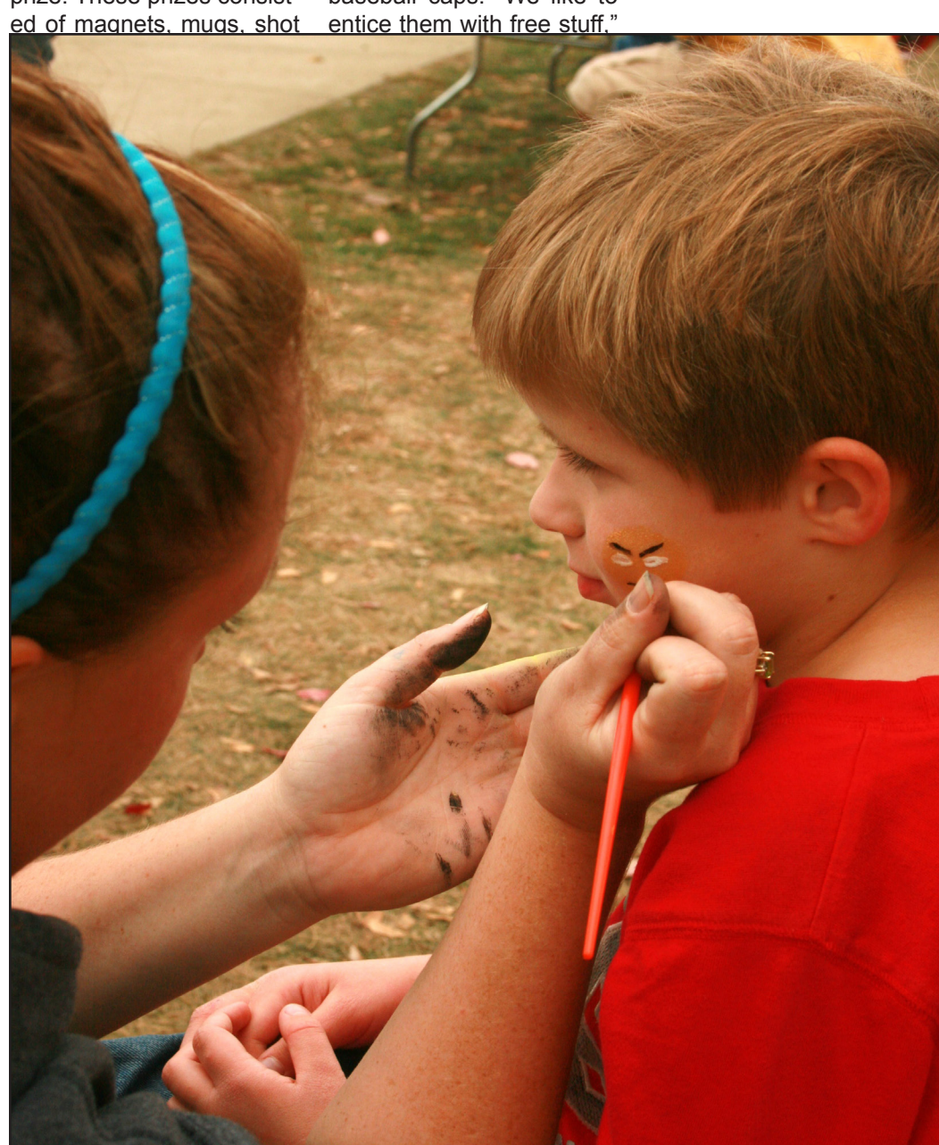
GETTING IN THE SPIRIT A student paints a gold and black design on a young visitor to Spirit Street. Sponsored by RHA, Spirit Street hosted different activities from each residence hall to help cheer on the Spartans.

they got an even better glasses, key chains, and said one of the vendors.