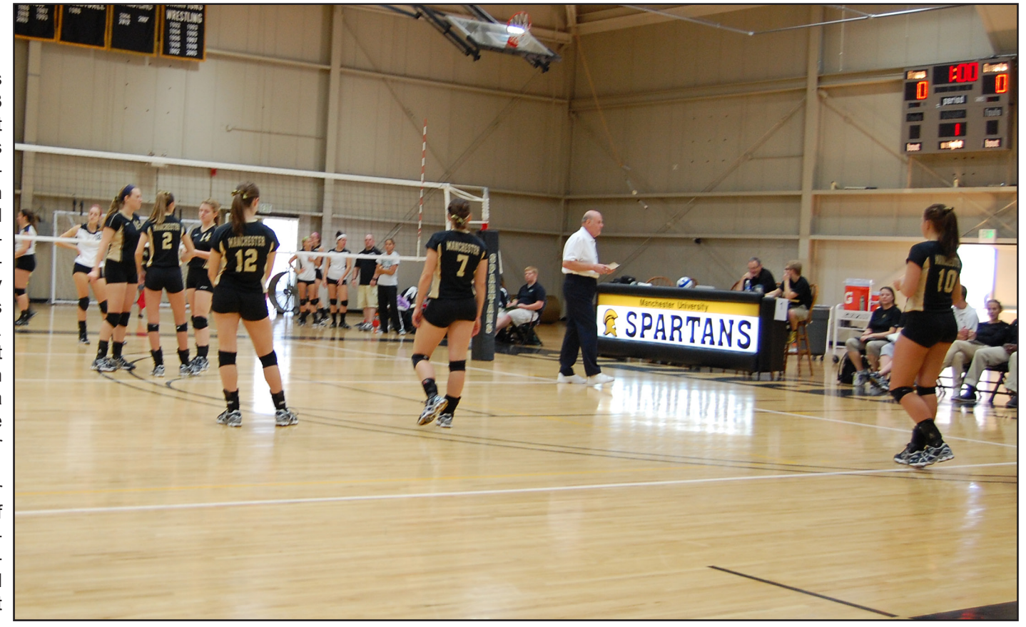
GAME TIME The Manchester Spartans volleyball team is pictured during a recent home match. As of Tuesday, Sept. 25, the Spartans held a 9-7 record on the season and has won six out of its last nine matches. Prior to falling to Kalamazoo and Adrian this past weekend, the Spartans had won three matches in a row. Tomorrow, the Spartans will hit the road to face the Hanover Panthers in an HCAC matchup and the Asbury Eagles in a non-conference matchup.

Playing games over the course of Friday, Sept. 7, and Saturday, Sept. 8 at Aurora University, the girls walked away with a tournament score of 2-2 before heading to the Windy City for a few hours of fun and team bonding. After the tournament ended Saturday, the team left Aurora on Sunday morning for Chicago to give the girls a chance to bond off the court. Organized by the coaches, the short retreat consisted of a few hours at Navy Pier, allowing the girls to walk around in small