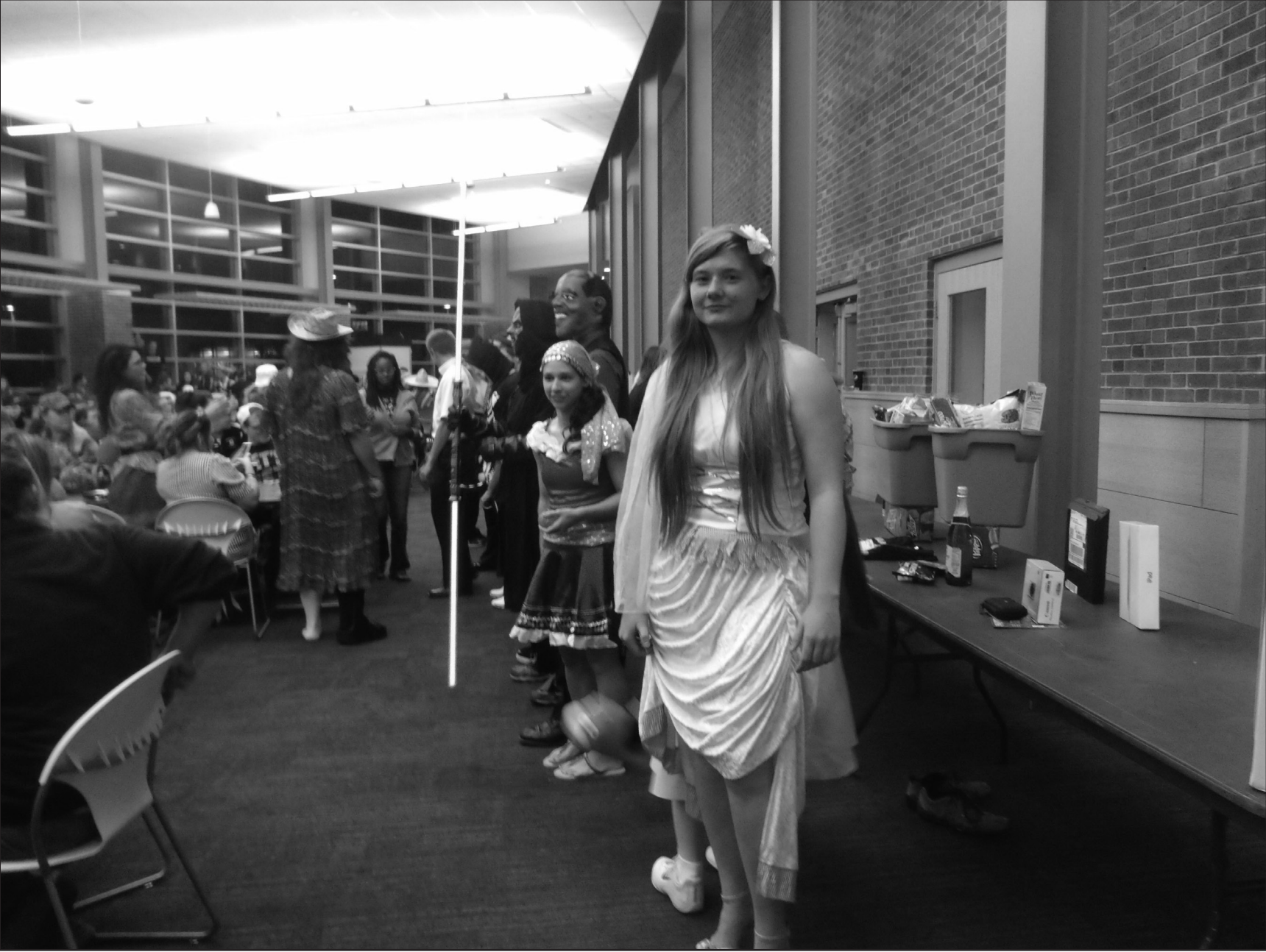
DRESSED TO IMPRESS Students lined up to be judged for their costume ingenuity at the MAC-sponsored BINGO night, Friday, September 28, with the hopes of winning a prize. Costumes were not the only way to win big at the event, as most prizes were given away to those who won a round at bingo. Prizes varied from food and movies to a Xbox Kinect and an iPad. Ultimately, students enjoyed their Friday night whether they won or not.