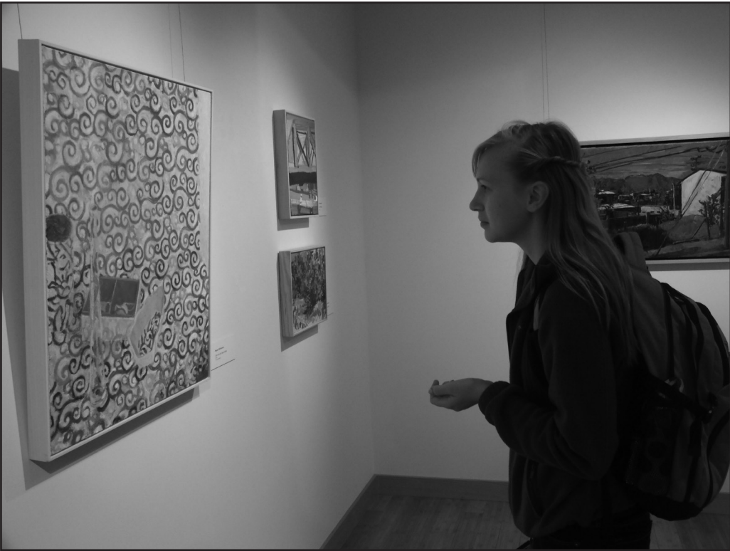
A PICTURE IS WORTH A THOUSAND WORDS A MU student studies one of the new pieces from the Midwest Paint Group’s showing of “Realism and its Discontents” that recently opened in Gallery G.

The gallery is located on the upper level of the Union across from the Success Center. And do not forget to look at the art in the Link Gallery in Winger and the lower level of the new Academic Center. Gallery G is open for view from 8 a.m. till 5 p.m. on Monday through Friday, closed on Saturday and open 12 till 3 on Sunday.