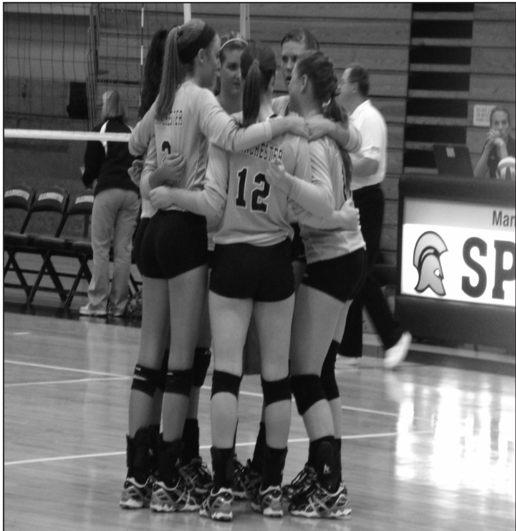
TEAM UP Members of the Manchester volleyball team huddle up during a recent home match. Last weekend, the team defeated Franklin but fell to St. Mary’s and Rose-Hulman. Currently, the team is 10-13 overall with a 1-4 record in conference play. The Spartans will hit the road tomorrow to face conference opponent Earlham at 7:30 p.m. Tomorrow, the team will remain on the road and play against Denison and DePauw at Denison University.