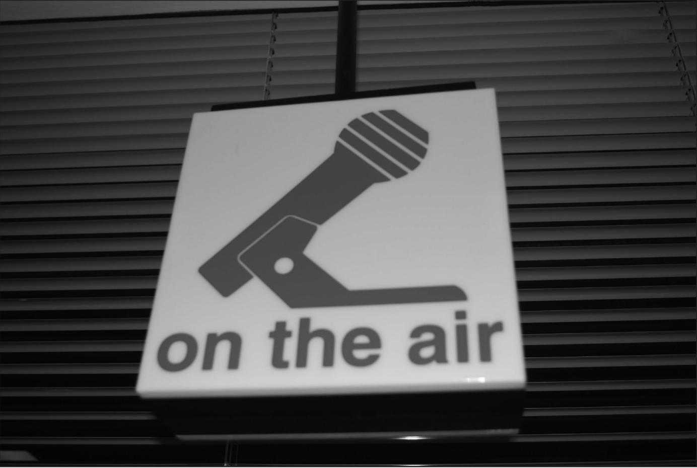
MUSIC TO OUR EARS WBKE, Manchester University’s on-campus radio station, is not only a source of education, news and music, but also it sponsors many music events in the local area, such as the Battle of the Bands and Chet Fest. On Nov. 30, WBKE will be hosting a concert in Wampler Auditorium for the band Trackless, the champion of last year’s Battle of the Bands competition. The event will be free to students.