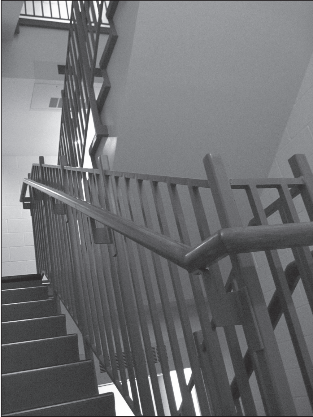
CALM BEFORE THE STORM Empty of people hurrying to get from one place to another, the stairwell in the new Academic Center seems to be safe for travel. However, this is not the case in the 10 or 15 minutes after classes have ended, and the stairs are suddenly a difficult place to be, especially if one is in a hurry.

That is the question that many people in the Manchester University community are trying to figure out: how do we rectify this potentially hazardous and currently inconvenient situation? Only time will tell, but for now all we can do is brave the horde of people jam-packed in the stairways, and slowly journey to our destinations.