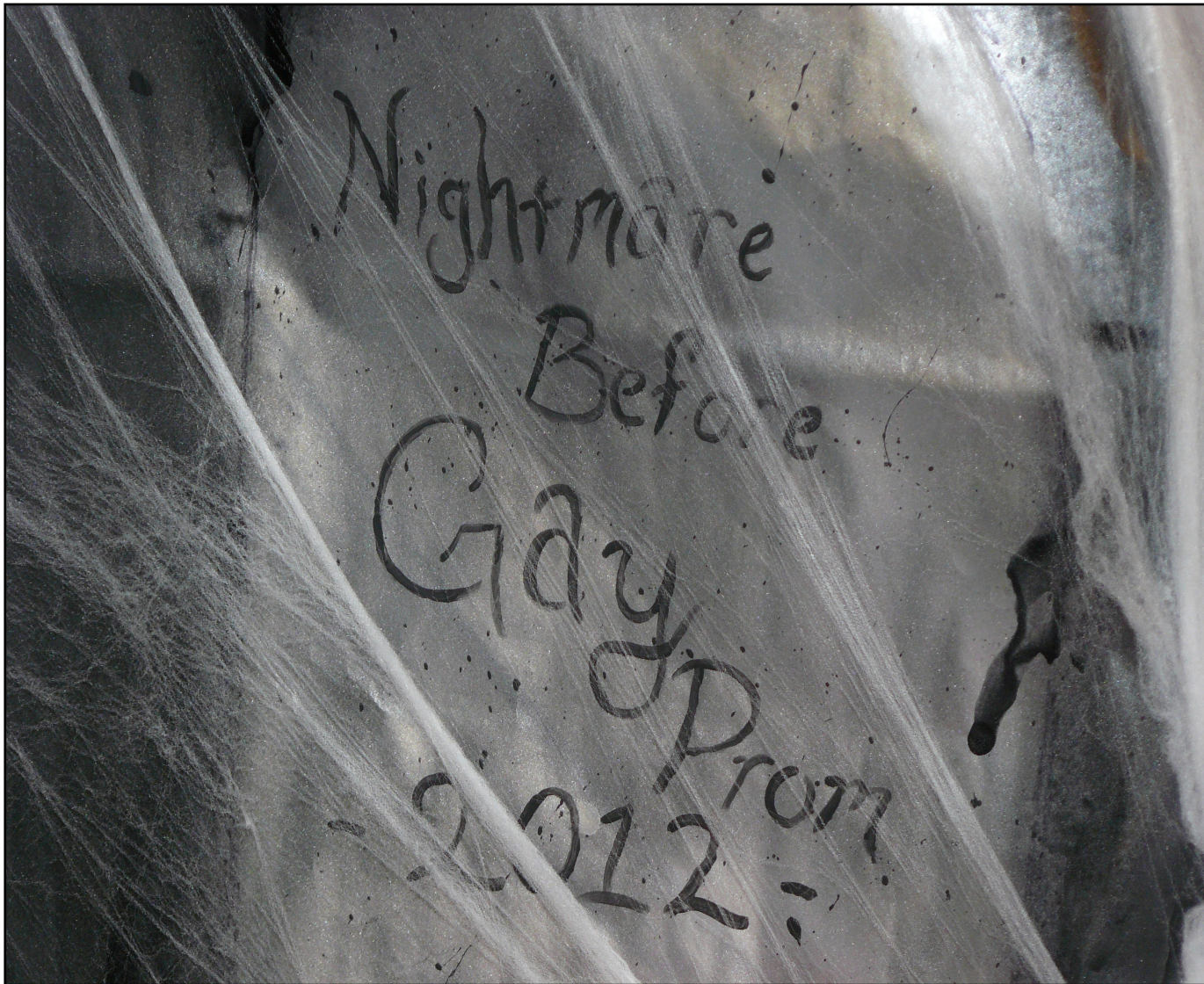
INCREASING SUPPORT United Sexualities hosted their Tim Burton-themed Gay Prom on Saturday, Oct. 6, as the closing event for Pride Week. This week of events was organized in hopes of encouraging acceptance of the LGBTQA community. Students participated in events like the Day of Silence & Night of Noise, Gender Blender Day, the Coming Out Vigil and more.

The audience was completely sensitive to what was being said. Some even cried because they were so touched.