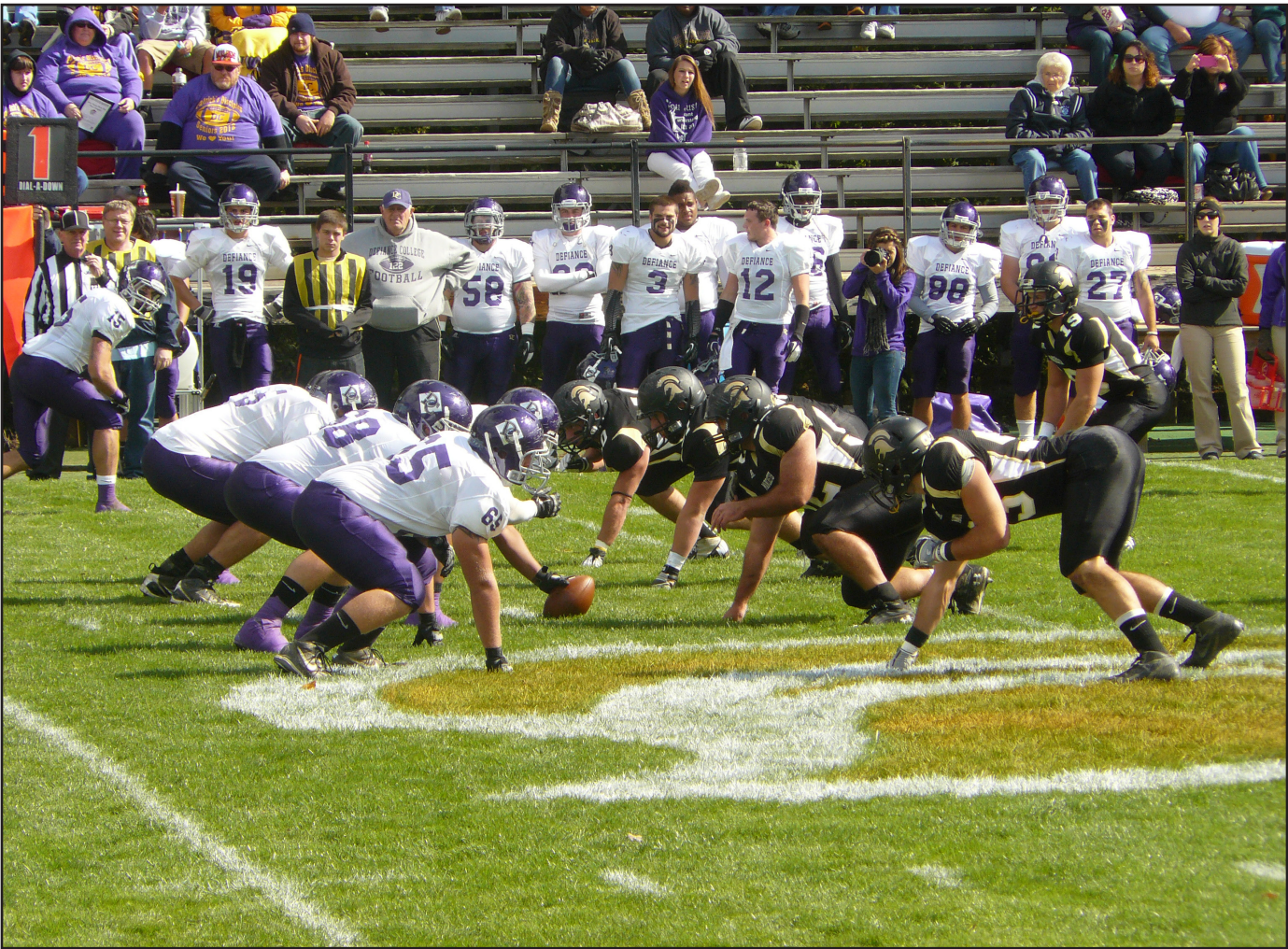
ON THE FRONT LINE OF BATTLE The Defiance offense lines up against Manchester’s defensive line during last Saturday’s game. The Spartans prevailed, winning by a final score of 34-28. The team is currently 2-4 on the season with a 2-2 record in the HCAC. Tomorrow afternoon, the Spartans will try to improve their record when they face the Earlham Quakers in their Homecoming game. The game is set to kick off at 1:30 p.m.

“With our young team we have been in every ball game but we just did not put four quarters of football together during