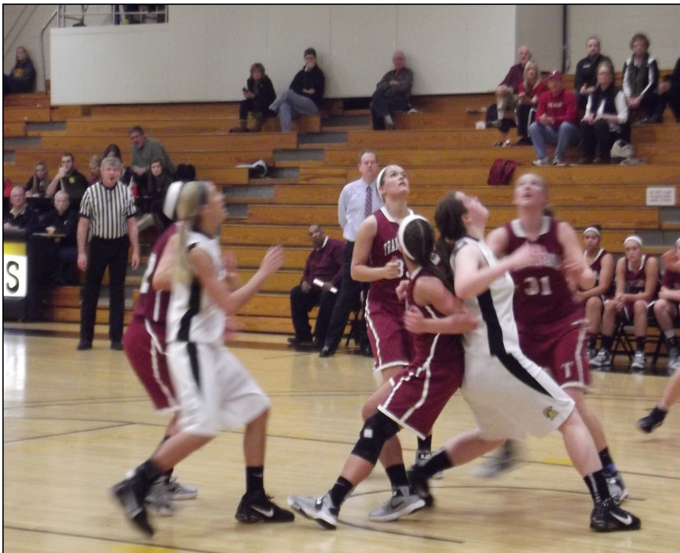
BATTLE FOR THE BALL The Manchester women's basketball team anticipates a rebound during its home game on Saturday, Feb. 9, against the Transylvania Pioneers. The Spartans fell to the Pioneers by a final score of 49-57. At the time of publication, the women's basketball team held a conference record of 7-9 and an overall record of 8-15. The Spartans will wrap up their regular season with a home game against the Earlham Quakers on Saturday, Feb. 16, at 1 p.m.

The last two games of the season are against Anderson (Feb. 13 at 7 p.m.) and Earlham (Feb. 16 at 1 p.m.), both at home.