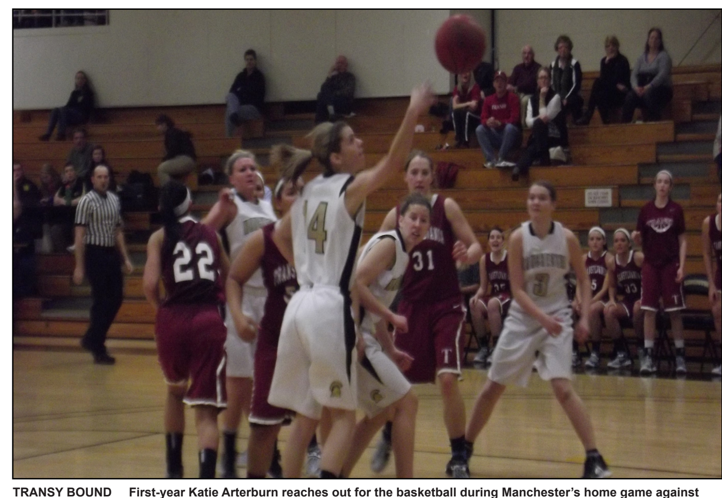
the Transylvania Pioneers on Saturday, Feb. 9. The team finished its regular season with an overall record of 10-15 and a conference record of 9-9. The Spartans clinched a berth in the Heartland Collegiate Athletic Conference Tournament, which will take place at Transylvania University. Manchester will face the Defiance Yellow Jackets in the first game of the tournament on Friday, Feb. 22 at 6 p.m.

Motivation has been a challenge for the team, as there are no seniors on the team. "Seniors