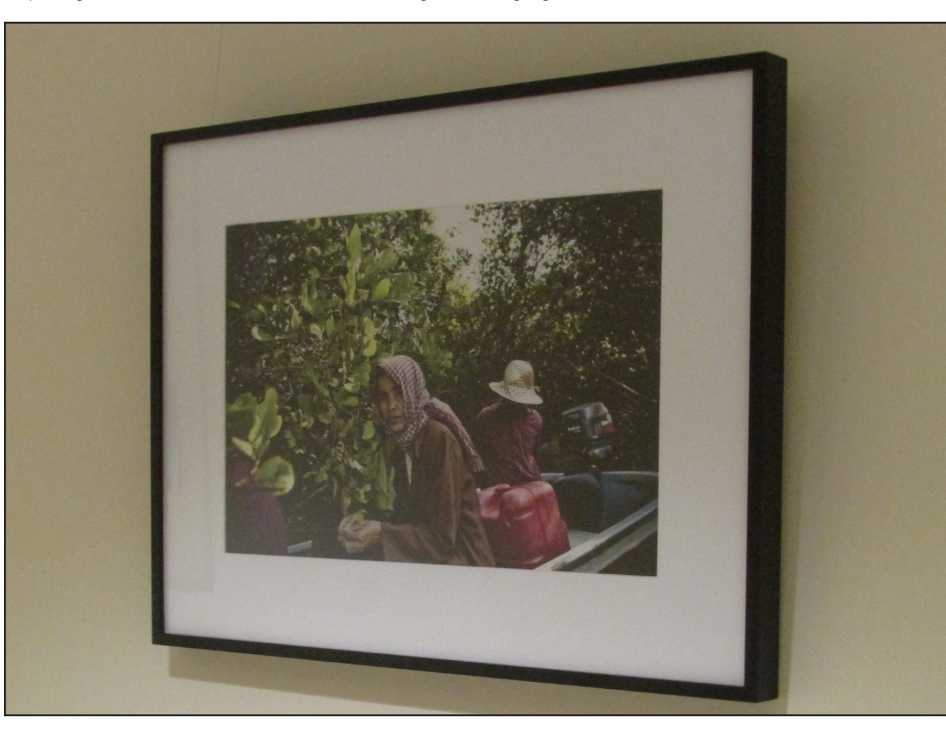
WORTH A THOUSAND WORDS On display in the first floor hallway of the Academic Center is one of the images that is part of Tim Matsui's photo series depicting the brutality, hardship and sex trafficking found in the lives of many Cambodians. Professor Ejenobo Oke chose this series to bring light to the story of Cambodian life and to allow viewers to understand the lack of true hardships in their own lives.

The exhibit will be on display until Oct. 11, 2013, while classes are in session. If students have time between classes, visit the first floor of the Academic Building for a graphic lesson on the human condition.