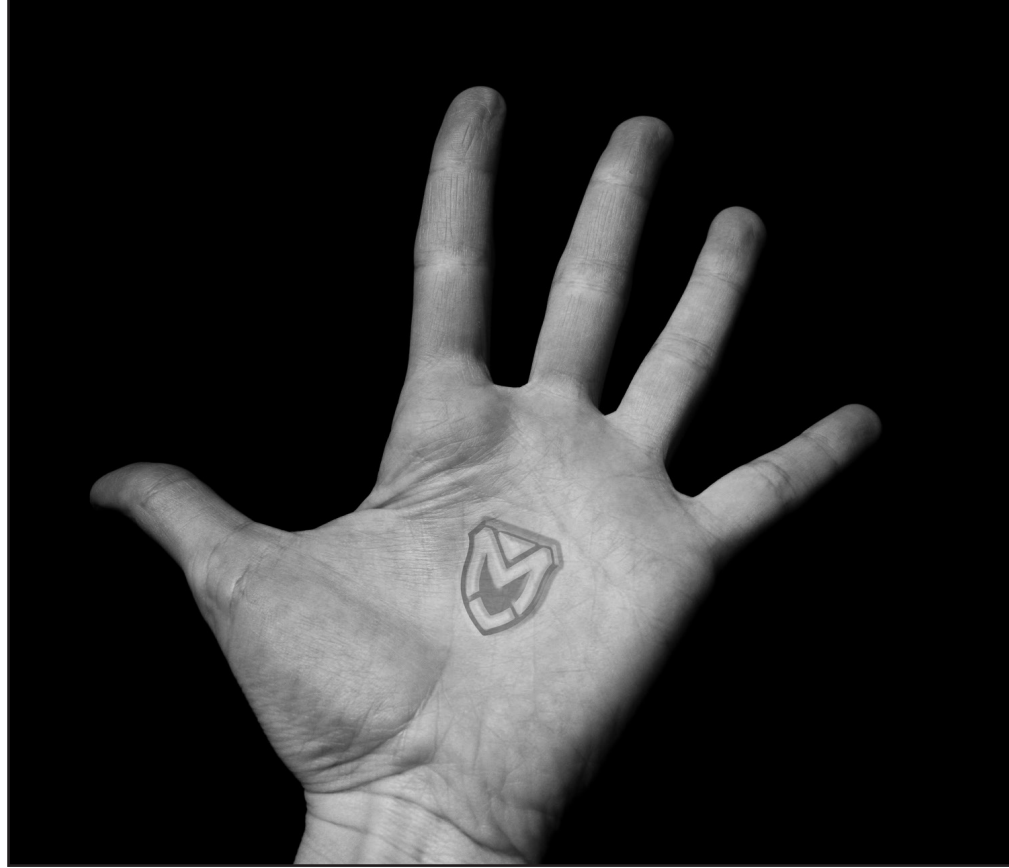
THE MARK OF THE FUTURE An anonymous student reveals the first prototype of the microchip that will soon be embedded in all MU students' hands. The microchip will benefit students from regulating their health and safety to storing their financial accounts.

All in all, these chips are a massive step forward, reducing the need of excessive wallets, purses, backpacks, ID cards and keys. They will decrease costs, increase productivity and aid in medical issues. Not to mention they will leave a stylish implant of the MU shield on everyone's hand. There will be an extra charge for the chip itself, however, the applications will be implemented will be funded by the government. "The microchips will save students a fortune in fees because we will be able to eliminate lots of paperwork and file cabinets," President Switzer said. "That will very likely reduce tuition because information that used to take lots of people, offices, furniture, and utilities to follow will now be on one file." This will help draw more students in by having lower tuition costs and help those who already attend by reducing the amount of money that they will have to pay back after graduation.