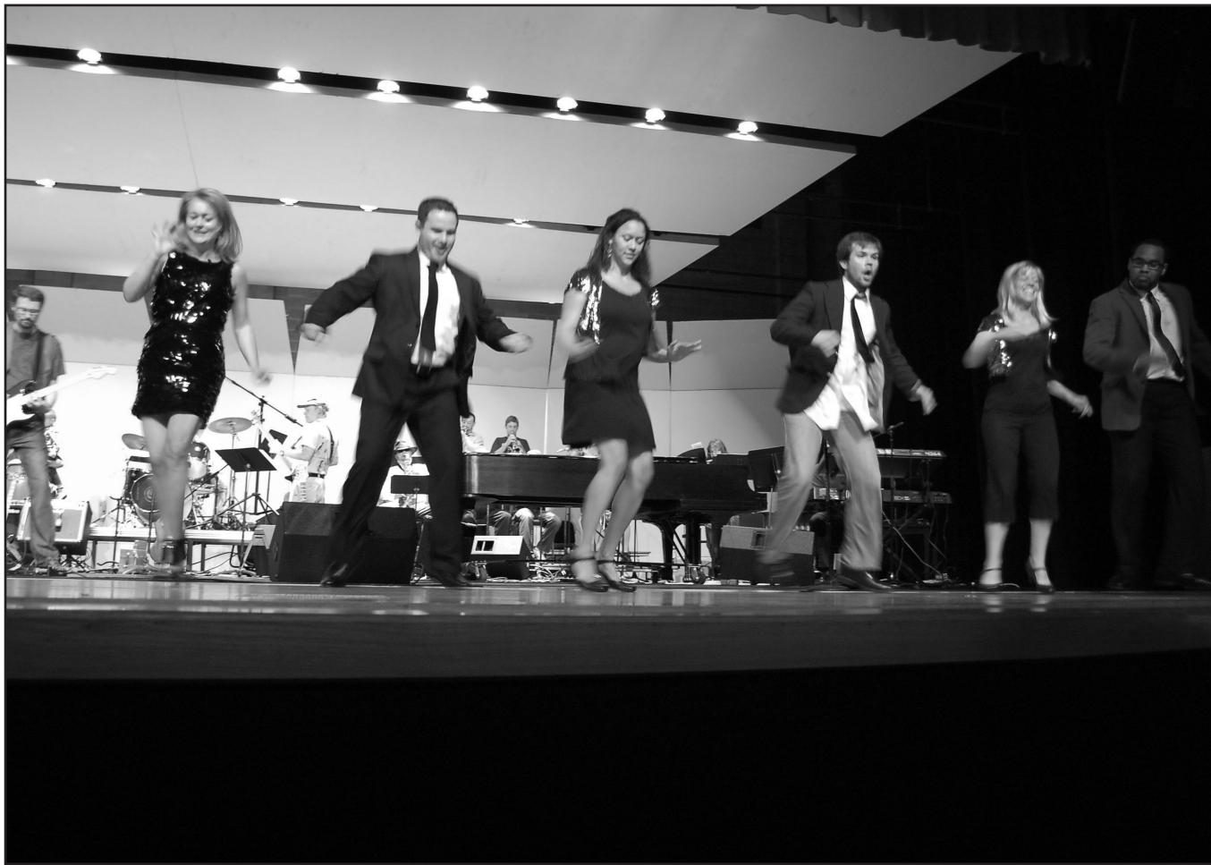
ROCK LOBSTER? The Ikettes and Friends coordinate their choreography for the World Tour, working in a few lobster-catching skills along the way. The Otho Winger Experience heads out this summer for its expedition toward musical dominance. They may or may not be back in time for class.