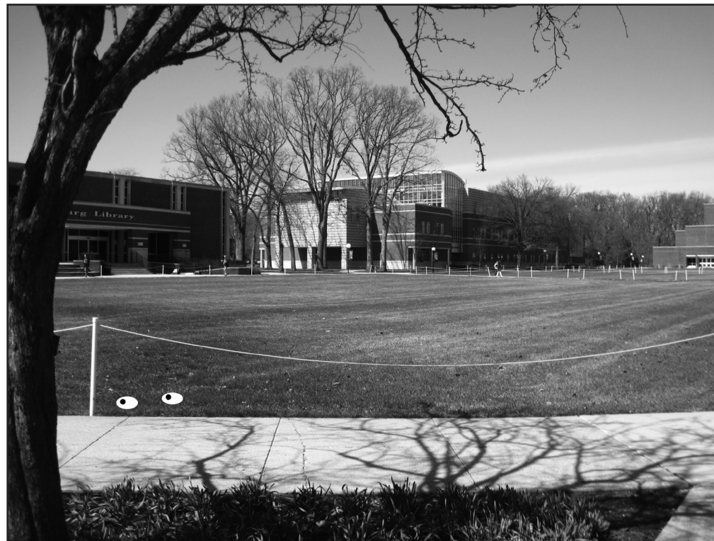
EAT YOUR GREENS? OR GREENS EAT YOU? Despite the love they once had for this grassy bit of land, Manchester students have been steering clear of the campus Mall since it was revealed that the species of turf recently planted has an appetite for human flesh.