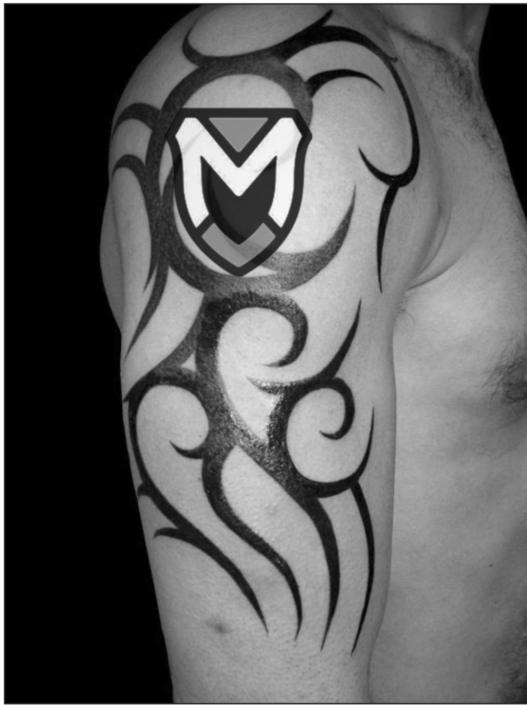
MANCHESTER INK An example of an MU-inspired tattoo design is displayed on the right arm of an incoming first-year student that wishes to remain anonymous until he arrives on campus in the fall. Manchester has implemented tattoo designs like the one above as a CORE requirement for all incoming first-year students beginning in Fall 2013.