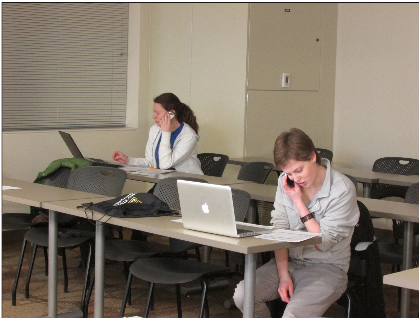
PHONATHON Manchester University volunteers make contacts at the phone banks hosted by the Peace Studies department on Sunday, Feb. 9, and Tuesday, Feb. 11. Volunteers made phone calls to senators, especially those in key districts that had not yet chosen a side regarding the proposed HJR-3 amendment, which would define marriage as between only one man and one woman. The phone bank efforts were in partnership with Freedom Indiana, a bipartisan group made up of individuals and organizations who oppose HJR-3.