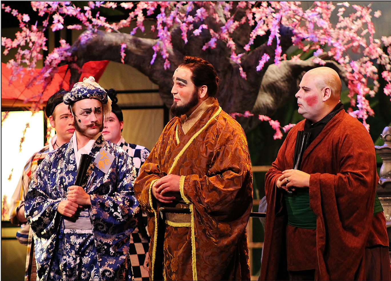
TREADING THE BOARDS Actors depict a scene during "The Mikado," a performance hosted by the MU Department of Music and the Manchester Symphony Orchestra over May Day Weekend. The show, which is an English comic operetta, was held in Cordier Auditorium and featured approximately three hours of energetic music and acting. Students who attended the performance held on Sunday, May 4, were awarded with VIA credit.