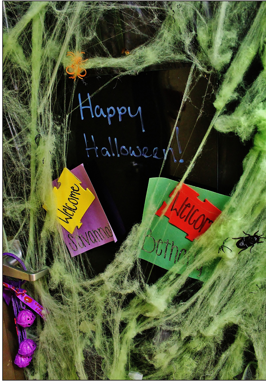
ALL HALLOWS EVE During the week of Oct. 27, Manchester's main campus held various Halloween-related events for student and local community enjoyment. The annual All-Hall Trick-or-Treat was held on Wednesday, Oct. 29, and each dorm hosted unique activities. While Haunted Garver Hall spooked visitors, Schwalm celebrated "Halloween Around the World," Helman hosted pumpkin coloring, Oakwood welcomed trick-or-treaters, and East held a decoration competition between its floors.

Halloween on campus is huge, from door décor to riding on golf carts, flying pumpkins and toast. There are events happening for everyone on campus to enjoy.