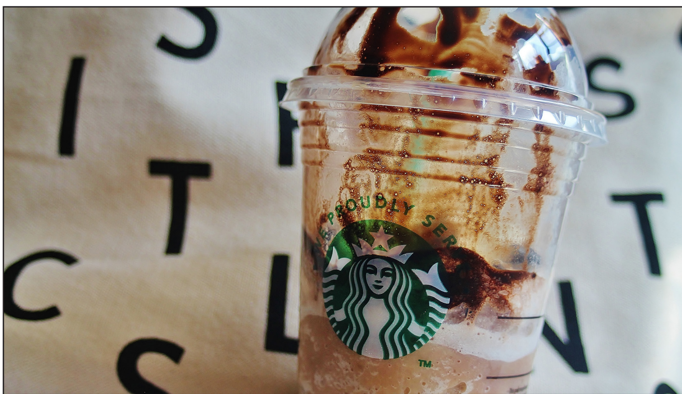
CAFFEINE-FREE Due to Manchester's recent ban of caffeine on campus, students have been unable to indulge in many of Sisters Café's coffee-related beverages, such as the frappuccino pictured above.