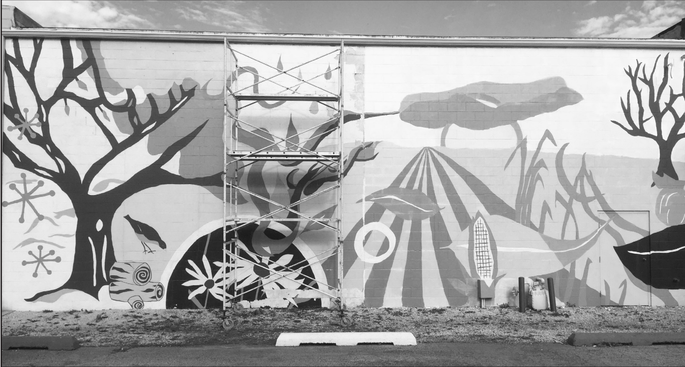
SPRING REDECORATING MU student artists collaborate with a local youth group to restore a mural on the corner of Wayne St. and Main St. The mural, painted on the Riverbridge Electric building, displays a colorful scene from each of the four seasons. It will be completed over the summer by students still on campus.