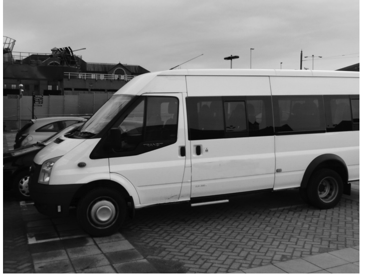
**Disclaimer: this is an artistic interpretation of the MU shuttle service.

Hacienda, Warsaw Sunday, April 24; May 8 Depart 5 p.m.