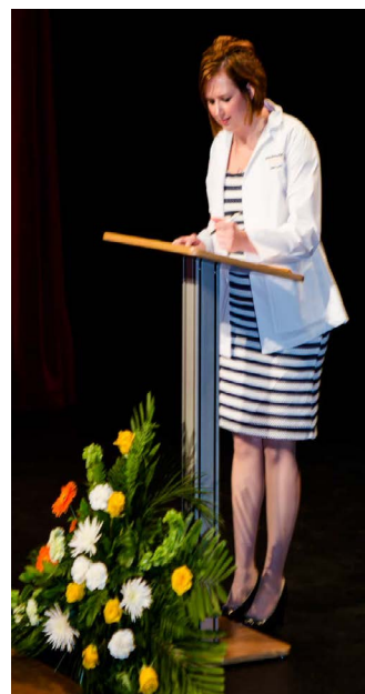
Students signed pledges of professionalism at the ceremony.

It also means the May 2016 graduates will qualify to take state Board of Pharmacy exams to obtain licenses to practice.