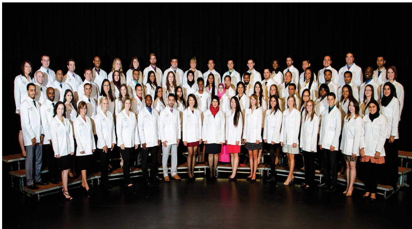
The incoming class members for the four-year doctoral degree at Manchester University's College of Pharmacy and Natural Sciences pose in their new white coats after a ceremony on Aug. 7 in Cordier Auditorium.