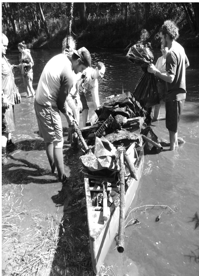
Volunteers collect boatloads of trash from the Eel River.