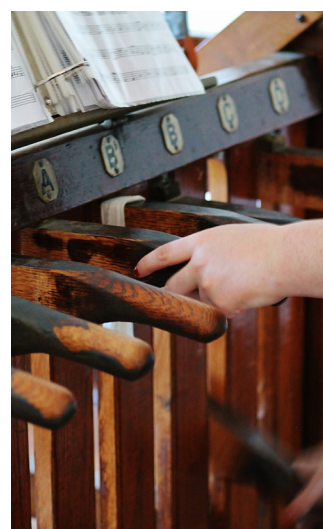
Stouffer demonstrates chimes.

Each bell is inscribed with scripture verses that reso-