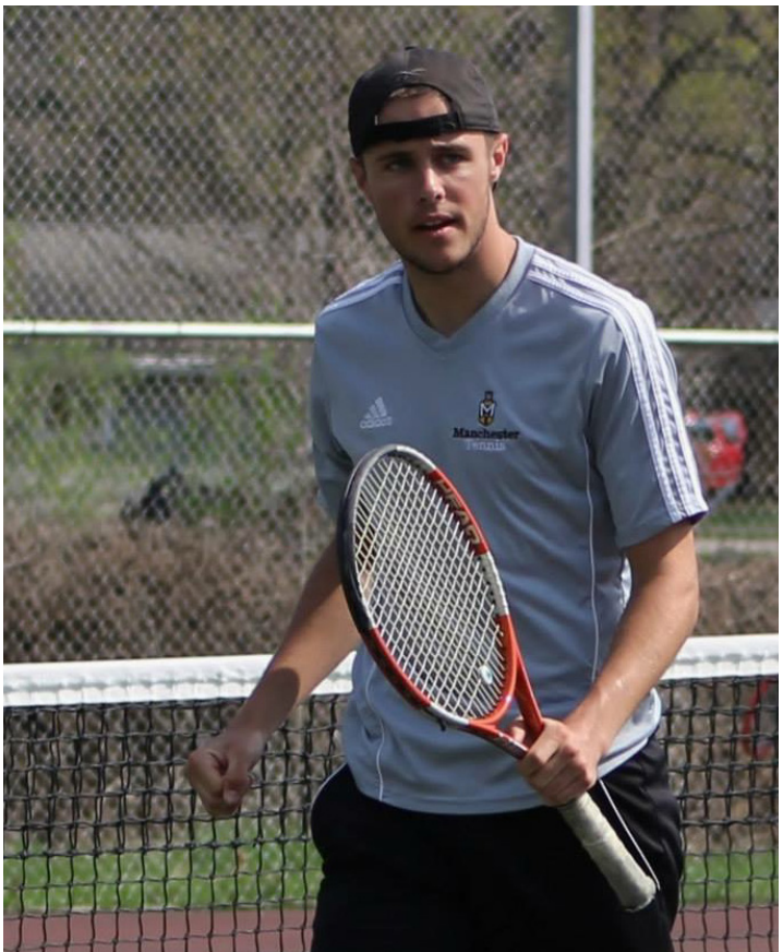
"The 'Place Behind the Pines' (the courts) is my Manchester home, where I truly wear my emotions on my sleeve."

Tennis has always been there for me through thick and thin, and I'm blessed that I can put on a Spartan uniform every fall and spring. I'm blessed and humbled serving as our team's top-ranked player for the upcoming season this spring. I never promise wins for the visitors coming to watch (superstition), but I'll always promise a good show. Be sure to bring your ear plugs, though. It's going to be a loud season.