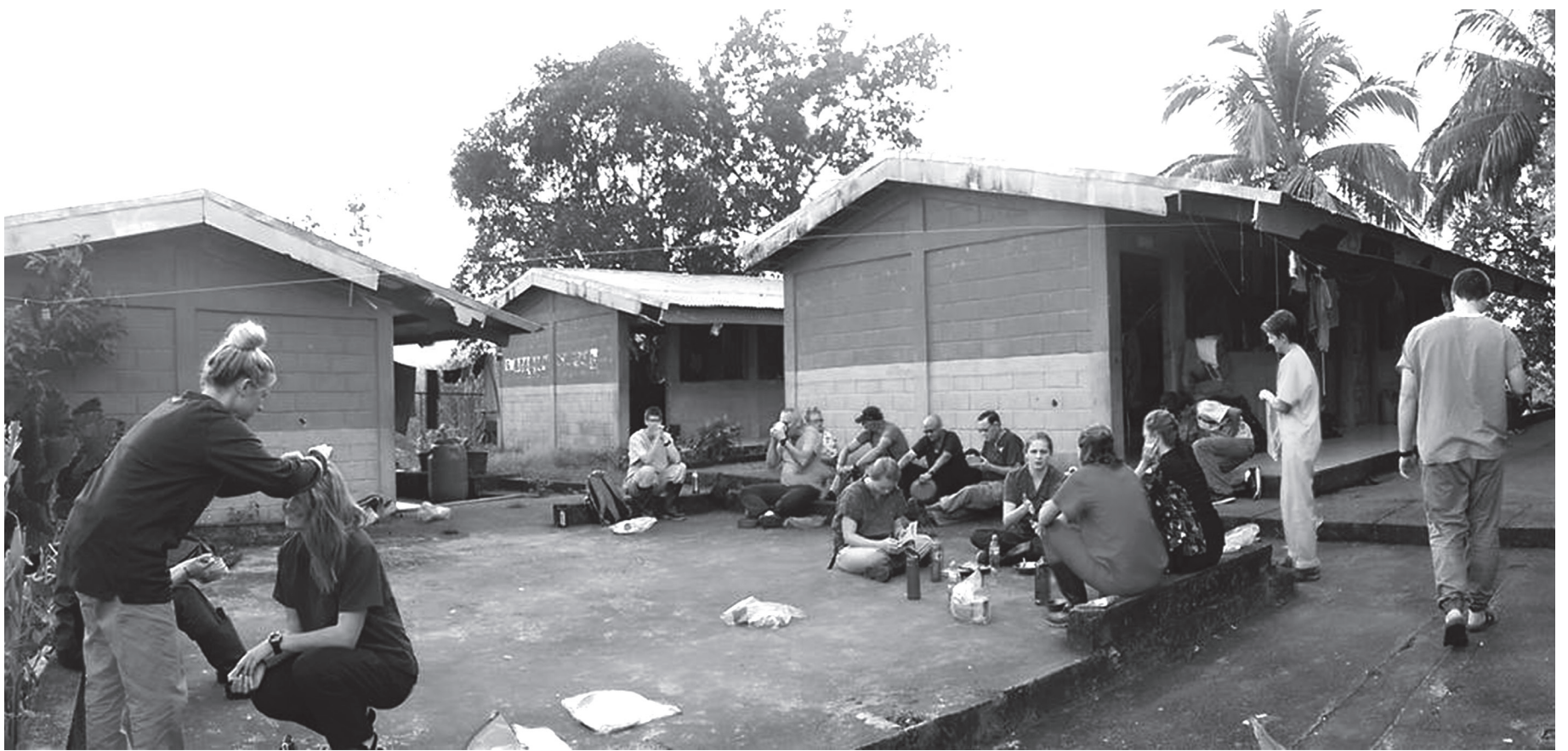
REAL-WORLD EXPERIENCE Students get the opportunity to develop their skills during a medical practicum abroad.