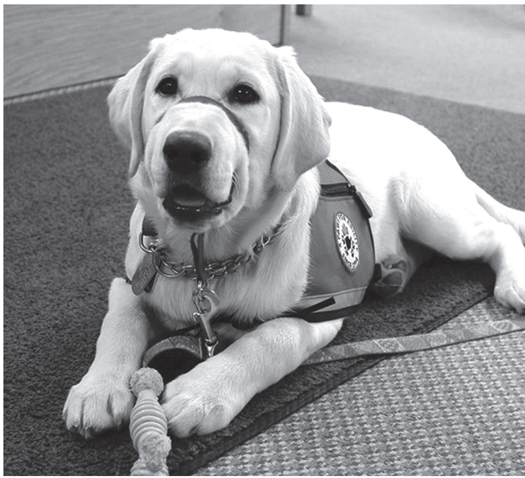
PUPPY-DOG EYES Danse rests after a day of terrorizing campus.

nothing to save us. These puppies are smart and cunning and unpredictable all at the same time. Hopefully, they have had their fun and will transform into the loving dogs that Manchester University was anticipating.