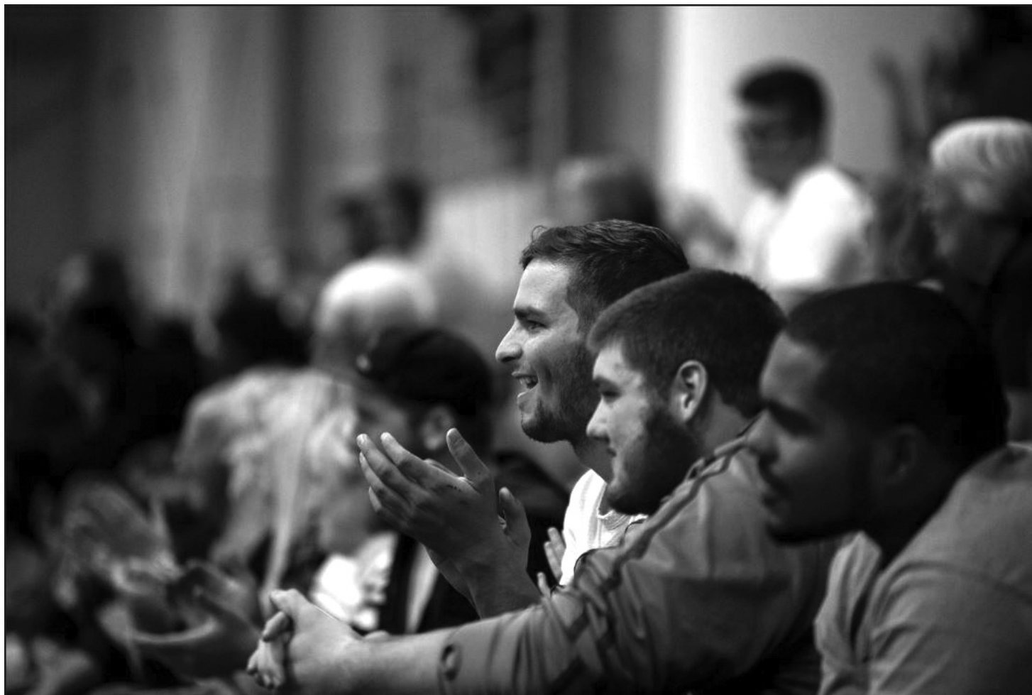
SHOW YOUR STRIPES Spartans will soon display black and gold streaks in their hair to demonstrate school spirit.

“Many teams seem to have their own competitive edge of spirit whether that is the bats they use, the way they wear their uniforms or the items they bring to a game,” he said. “However, our school spirit trumps them all with our hair being dyed black and gold. No one can express more school spirit than our Manchester Spartans.”