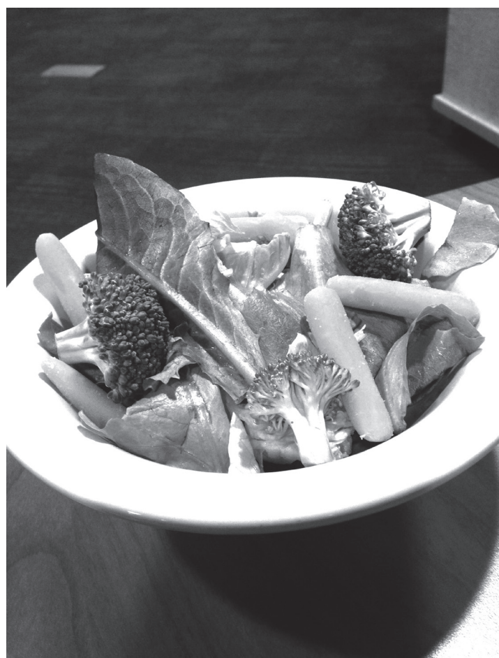
GOING GREEN The Green Bowl serves up fresh fruit and veggies to hungry Spartans.

But unless students eat the fruit and veggies when they are fresh, their salads will contain such "spoilage."