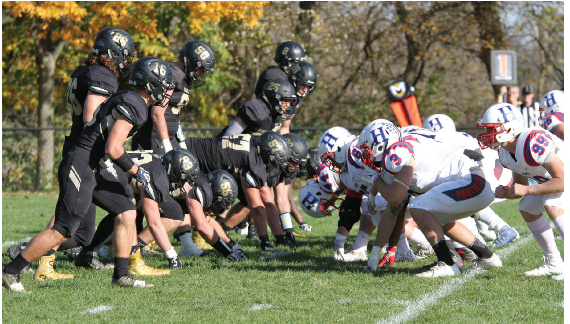
Spartans face Hanover Panthers