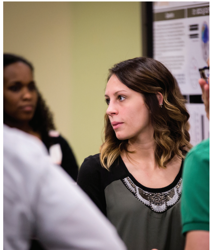
Students present at Research Symposium, Spring 2016

Students should submit their abstracts online by March 3, 2017, at 11:59 p.m. Presenters will receive their acceptance notification on March 13, 2017. Auditions for the Keynote will be held on the week of March 28, 2017. Poster presenters should submit a PDF of posters on March 31, 2017 by 11:59 p.m. Detailed information can be found on the Symposium webpage: www.manchester.edu/academics/academic-resources/student-research-symposium .