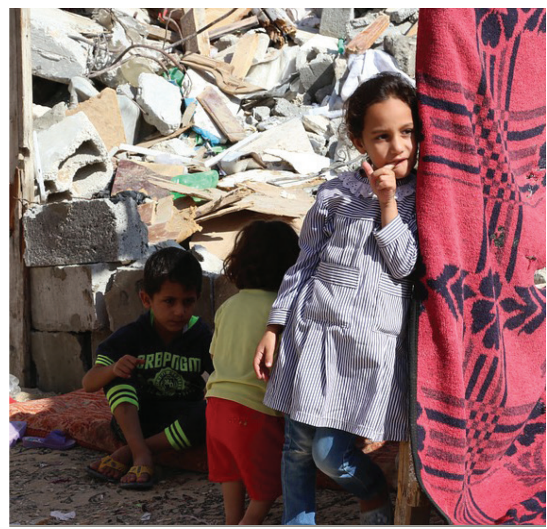
Children in the Gaza Strip

It's no secret that the Middle East is not a comfortable, easy-going place. People face a struggle every day that a majority of the people in North America never come close to experiencing. In Palestine, people fight for their freedom to say what they want, to do what they want and to be able to live in a country that isn't dictated by a corrupt government. Palestinians fight for their right to be hu-