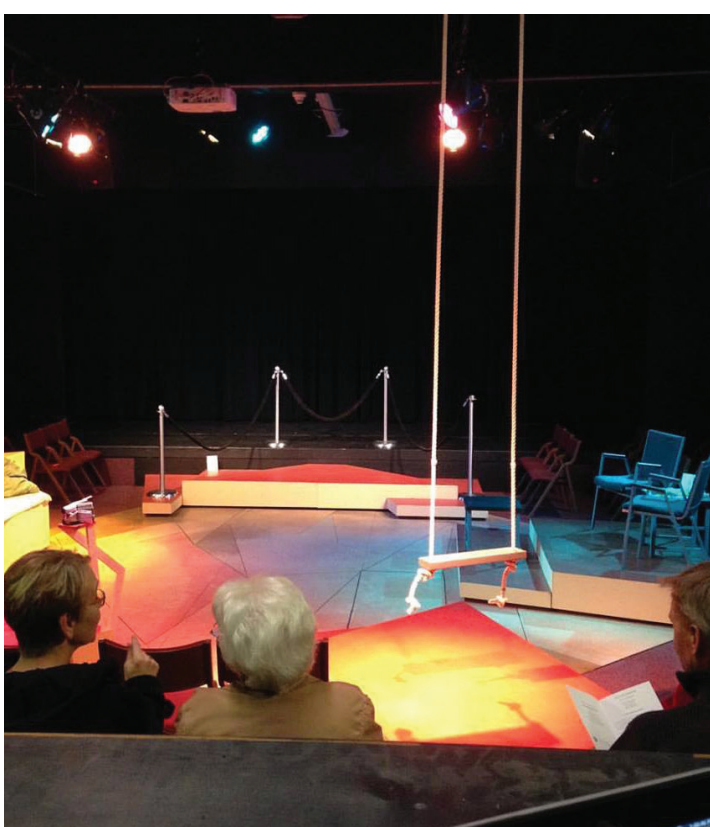
'The Shape of Things' Stage in Wampler Auditorium

As these things tend to go, the encounter leads to a date, and from then on, a whirlwind romance takes place. Over the course of a semester, Adam transforms from a nail-biting, frumpy jacket wearing pushover to a confident, more handsome version of himself. The greater his feelings for Evelyn grow, the more willing he is to push the boundaries of his comfort zone.