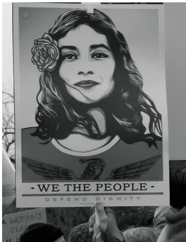
A protestor holds up a sign designed by Shepard Fairey, who also designed the iconic Obama “Hope” image.