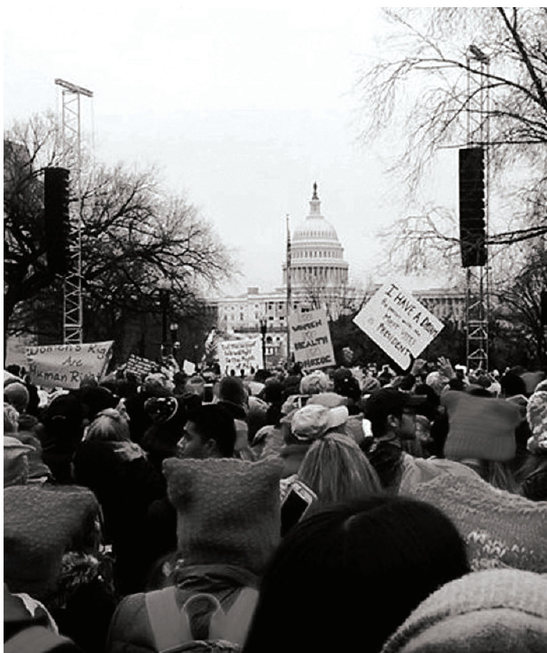
Activists march in front of the Capitol Building on Jan. 21. Over 1 million men and women flooded the streets of Washington D.C., and many wore “Pussy Hats,” the knit caps shown in the photo.