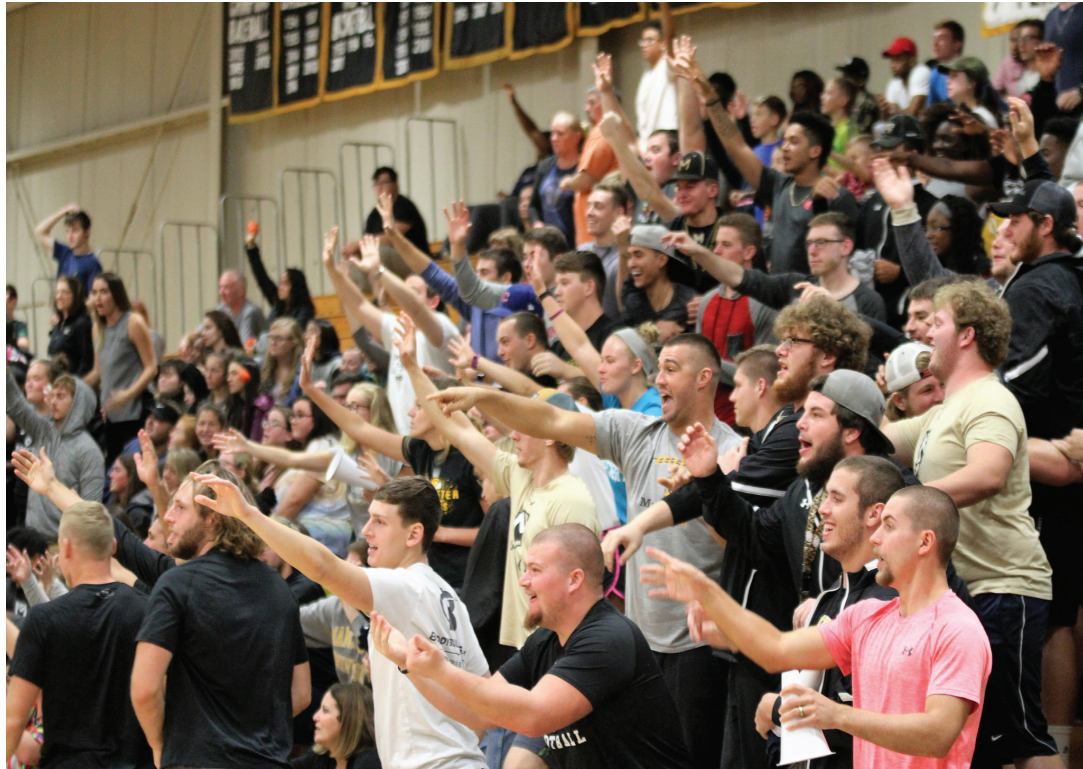
Students in the stands excitedly raise their arms and wave them around, trying to catch giveaways. T-shirts, retro jerseys and small basketballs were given away as prizes.