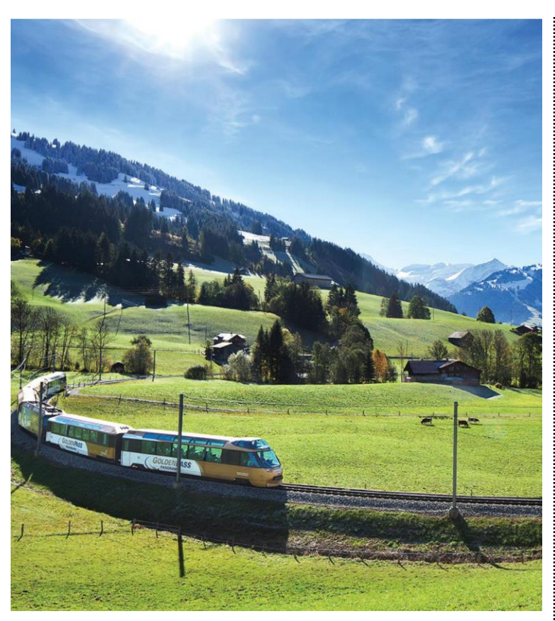
10 Days • 12 Meals : 8 Breakfasts, 4 Dinners

HIGHLIGHTS... Bern, Cheese Making Demonstration, Montreux, GoldenPass Panoramic Train, Gstaad, Lucerne, Austrian Alps, Choice on Tour, Innsbruck, Salzburg, Mirabell Gardens, St. Peter's Restaurant, Bavaria, Linderhof Palace, Tyrolean Folklore Show