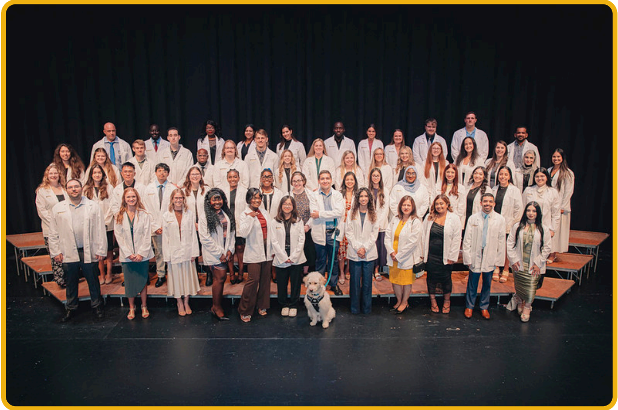
Class of 2029 White Coat Ceremony

We are are proud to welcome a total of 57 pharmacy students to Manchester this year! During the White Coat Ceremony on August 22 nd students donned their white coats for the first time. We can't wait to see what the future holds for you!